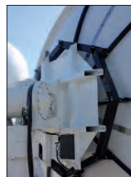
Operator interface and MEOS™ Antenna

Note: MEOS is a registered trademark of Kongsberg Spacetek AS. Specifications are subject to change without notice.